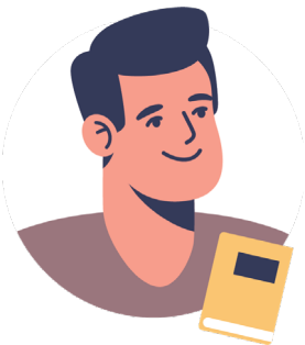
Teachers and school support staff