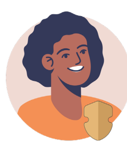
Law enforcement and first responders