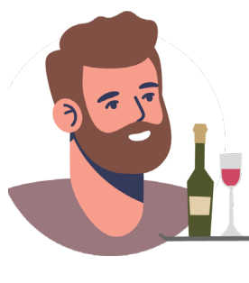
Tourism and hospitality workers, including food service